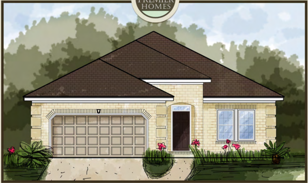
SAINT AUGUSTINE - ELEVATION A